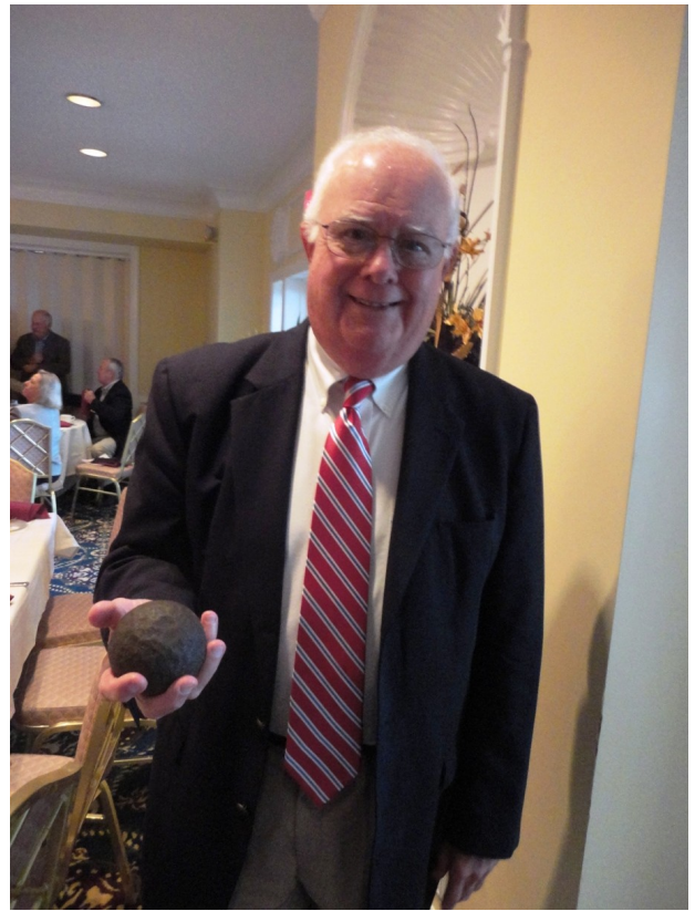
24 Aug 1814 King George & Stafford Counties