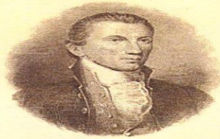
JAMES MONROE MEMORIAL FOUNDATION