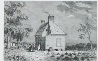
This 1845 woodcut of the Monroe home shows a typical middle-class farmhouse of the 1750s. The foundations show that the house was 24 x 58 feet. The farm would also have included a kitchen, barn, outhouse and other outbuildings.

as Minister to France, England and Spain, as Governor of Virginia, as Secretary of State and Secretary of War before his election as President. His two terms as President 1817-1825, were known as the Era of Good Feelings and he remained immensely popular