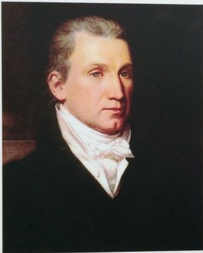
James Monroe by John Vanderlyn 1816.