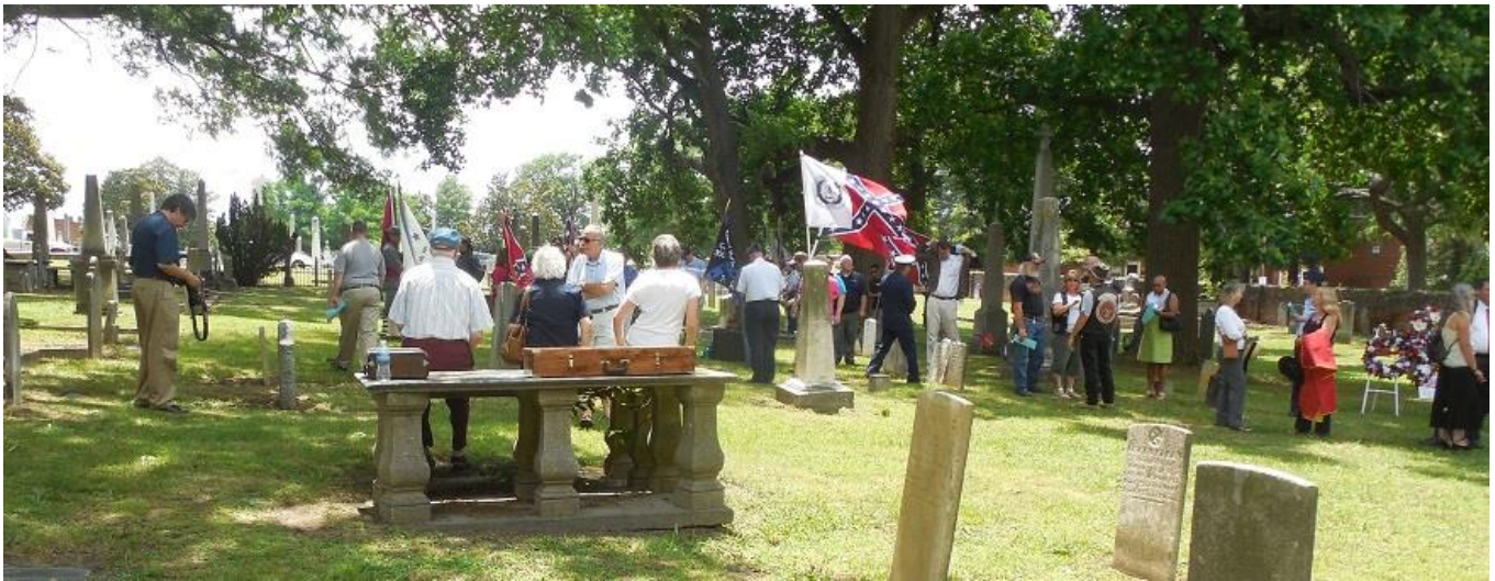
Some of the attendees gather for the ceremony

Below is a copy of the program and some photos that were taken