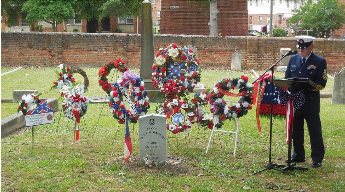
The wreaths presented during the ceremony. The War of 1812 Society wreath is to the left of the gravestone