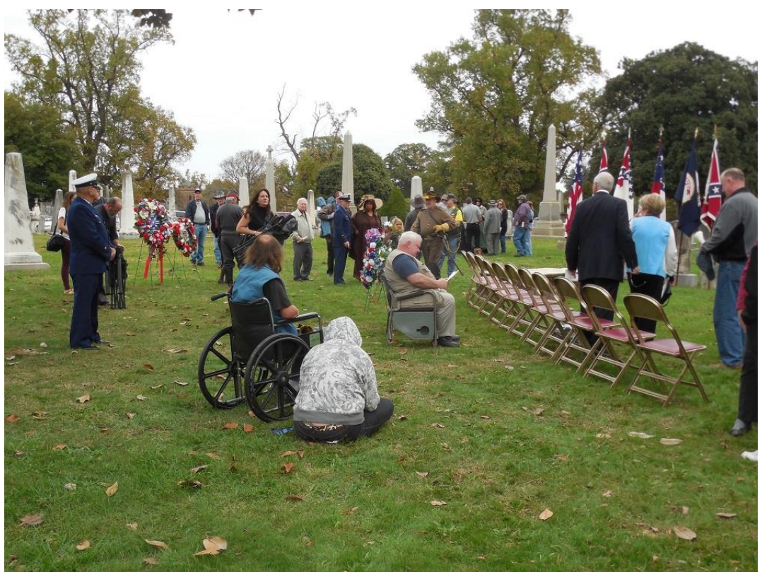
Above some of the attendees