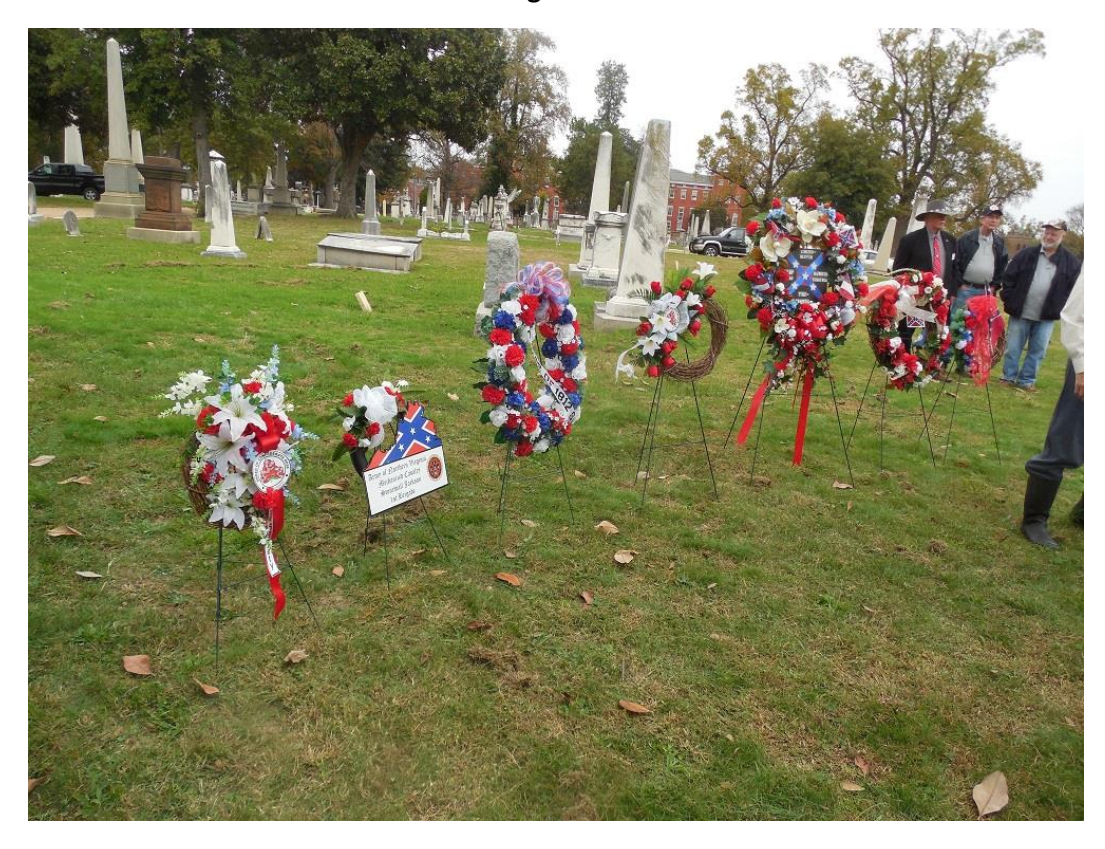
Wreaths presented The 1812 Society wreath is 3^{\rm rd} from the left