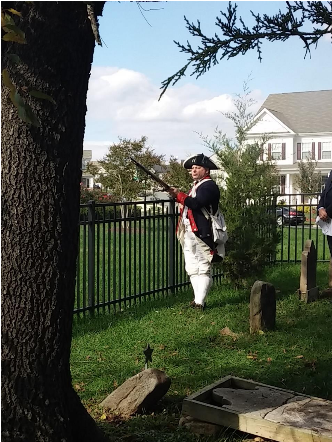
Below a musket firer from the Colonel William Grayson Chapter did the musket salute