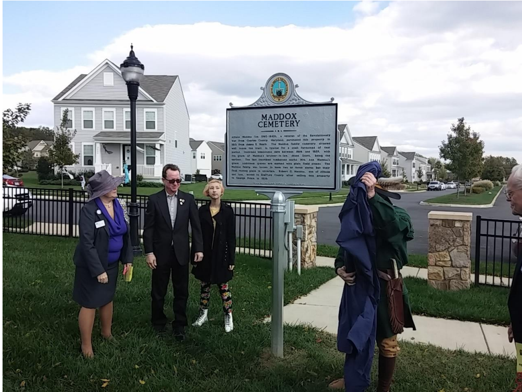
The sign was sponsored by the two societies in conjunction with the Prince William County Historical Commission