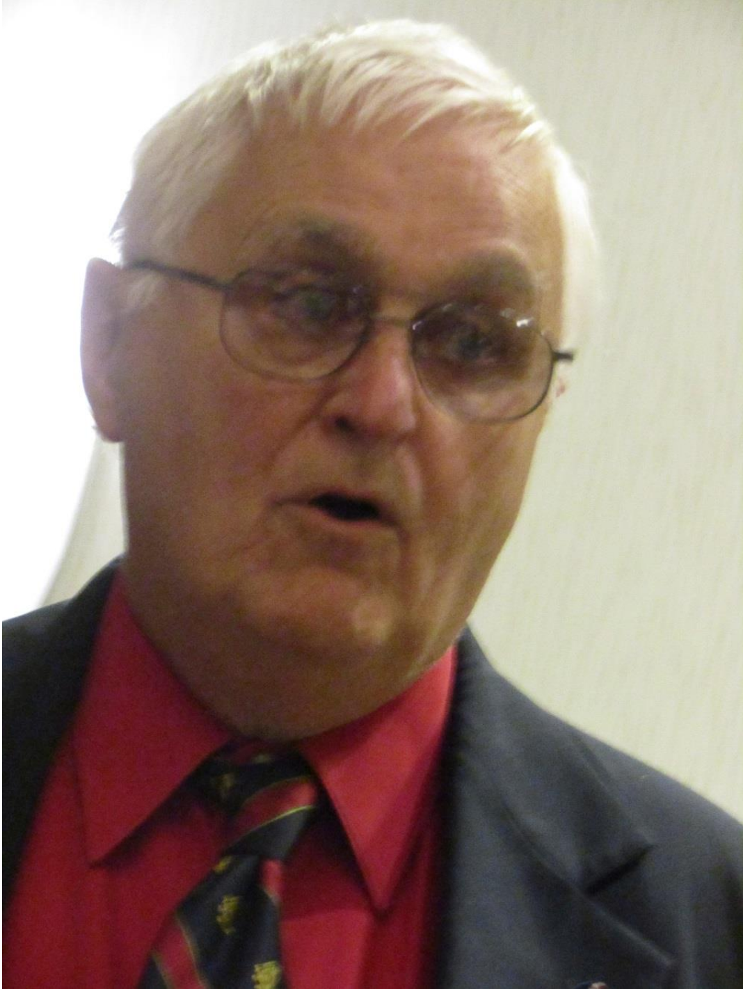
Photo showing more attendees