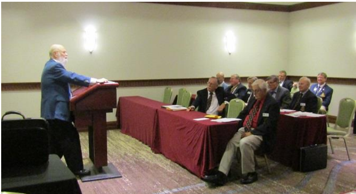
President Poland is shown presiding over some of the attendees Some arrived late due to the VASSAR meeting