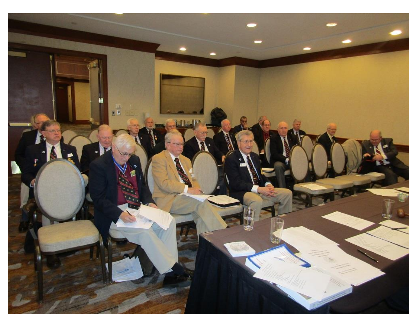
Above the photo shows some of the 24 attendees Below is a group photo taken outside the meeting room