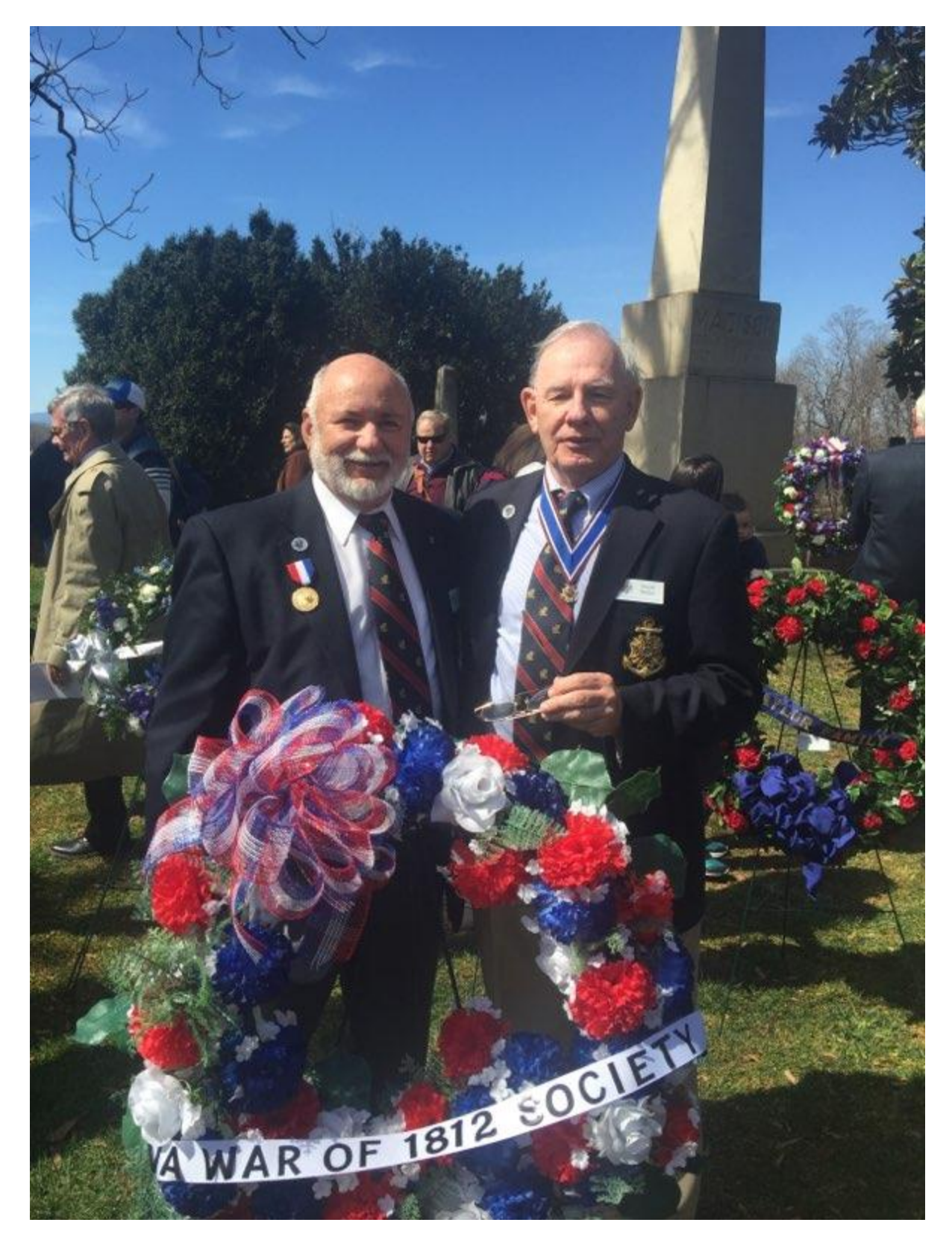
Below is the society's wreath with the President Madison's monument in the background