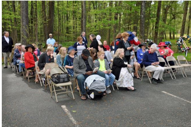
Below is the program: