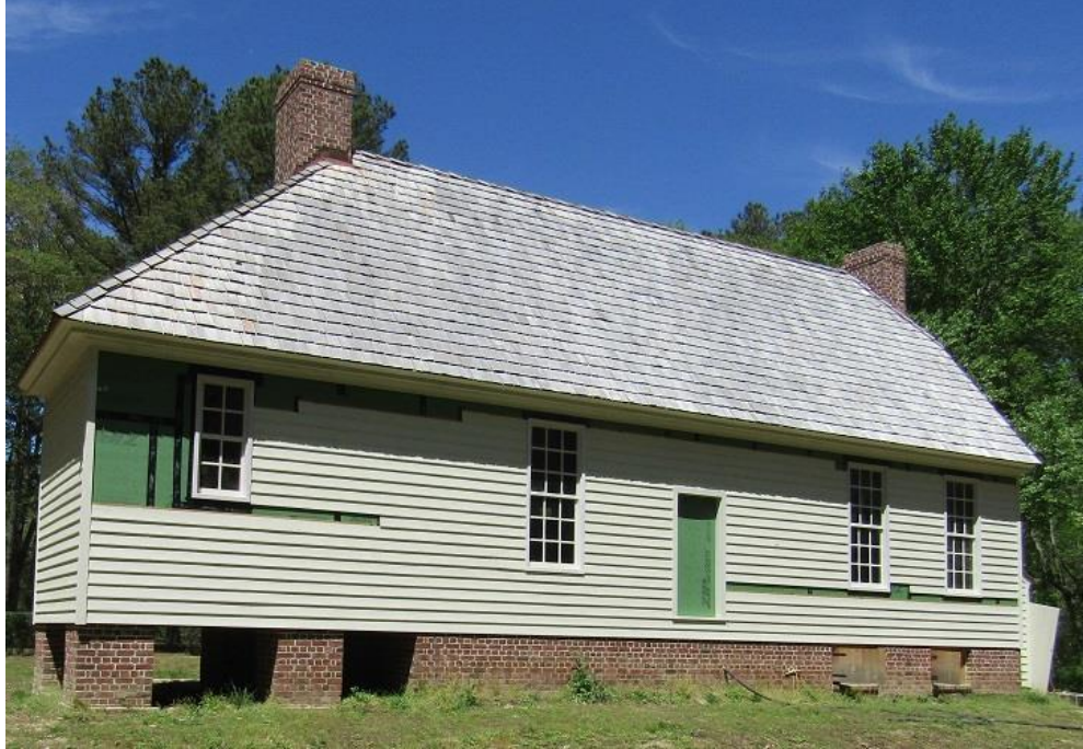
Above the back of the outside of the house is almost completed. Below at the site is this mounted plaque