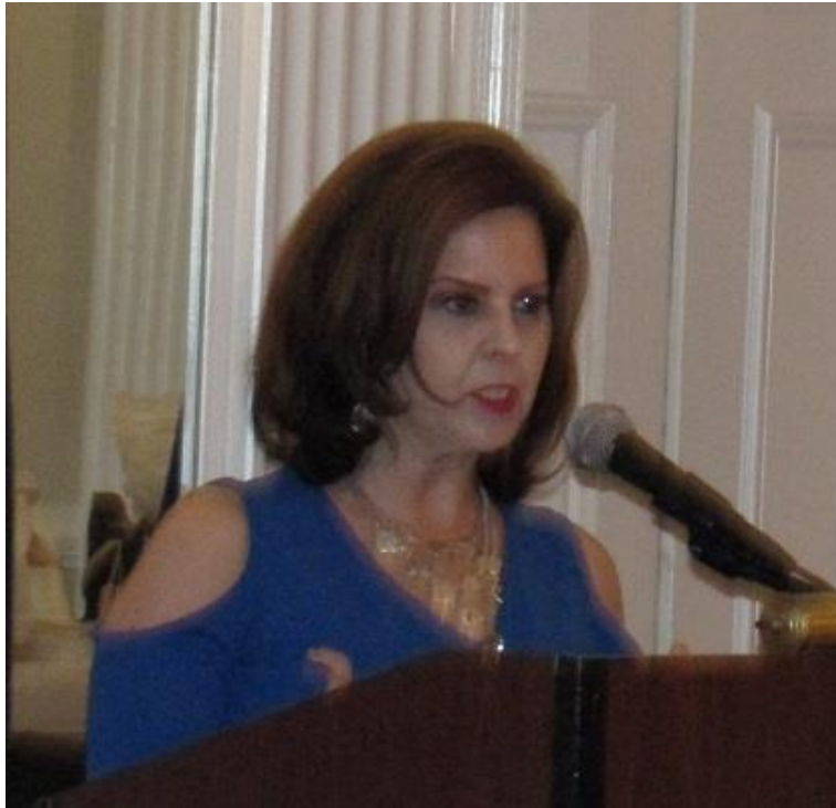
Below are some tables of members and guest eating