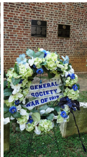
General Society wreath Presented during the ceremony