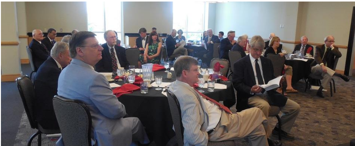
Some of the attendees at the luncheon