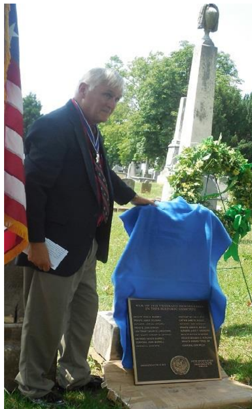
The plaque is unveiled