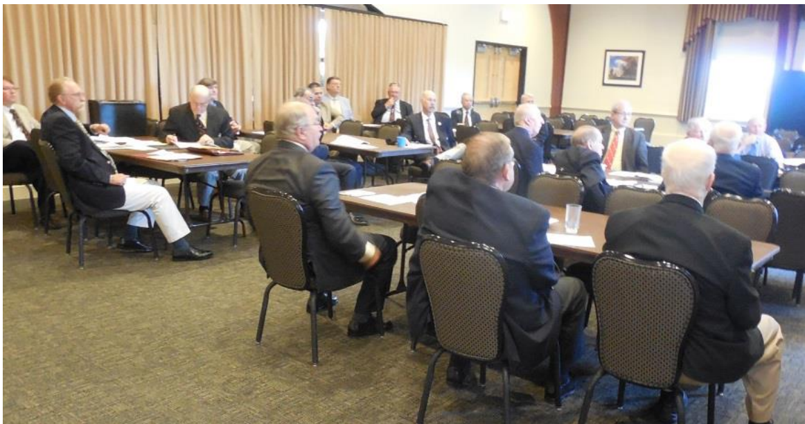
Some of the meeting attendees