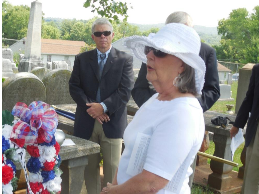
The regent from the local DAR chapter gives greetings