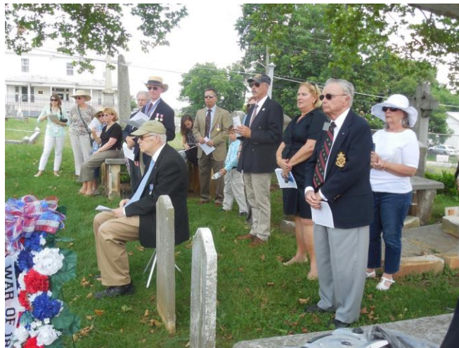
Some of the attendees