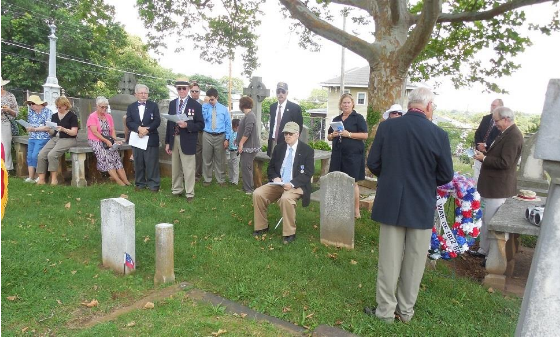
Another view of attendees