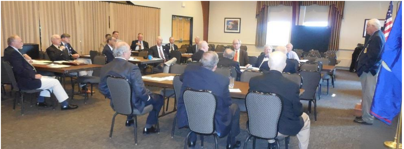
Another view of meeting attendees