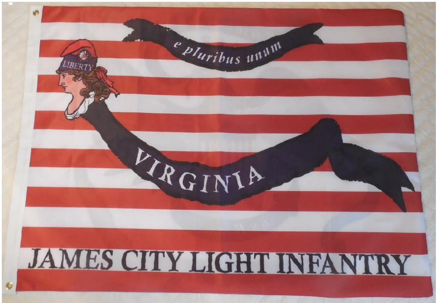
When mounted on a pole and used in the color guard of the society