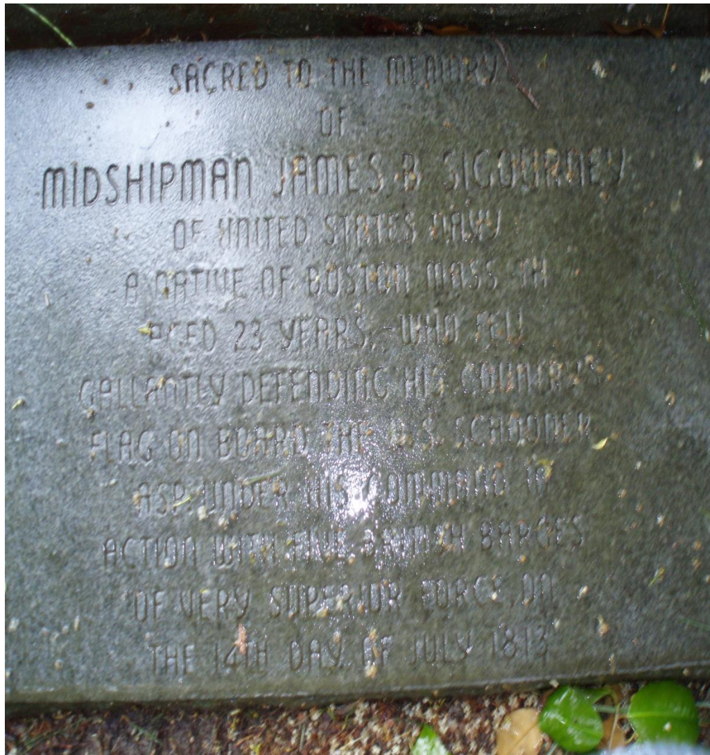
Below: This cannon rests at the site of his gravestone. Note the U.S. Daughters of 1812 grave marker in front of the gravestone