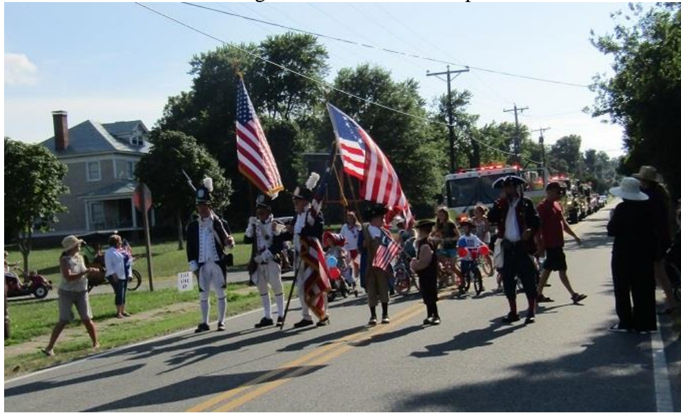
Children are shown below following the color guard