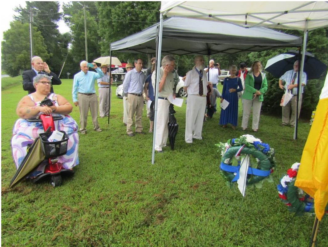
Above shows some of the attendees