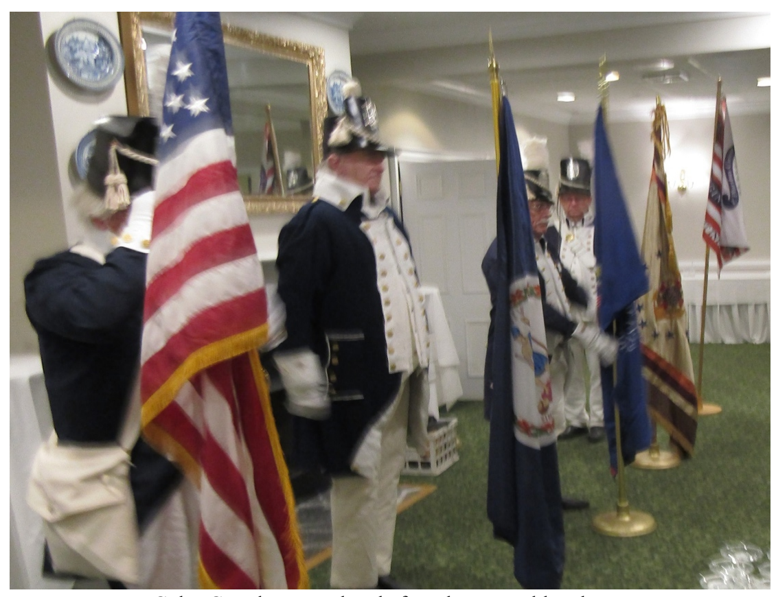
Color Guard posts colors before the general luncheon