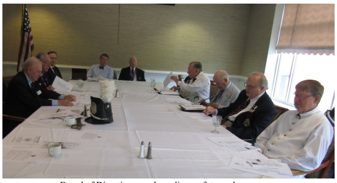
Board of Direction members discuss future plans