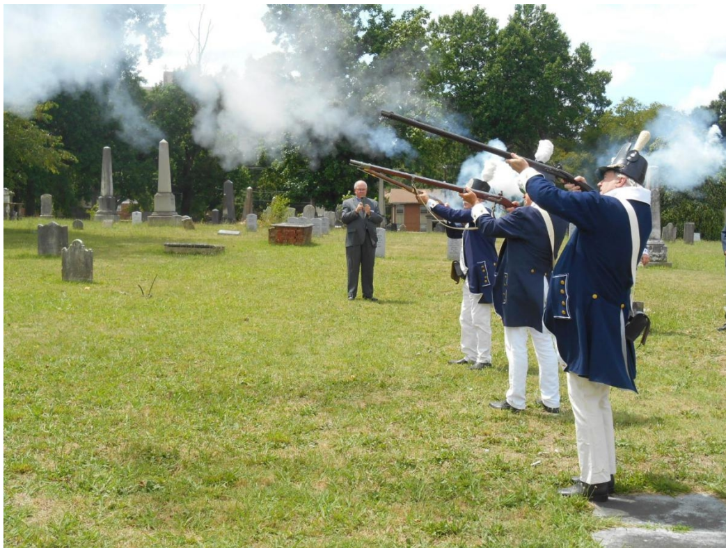
Honor Guard conducts musket firing after taps