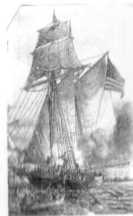
Boarding of the Dolphin and the flying Star Spangled Banner