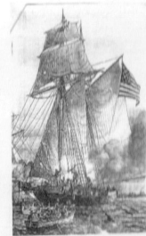
"Remember The Dolphin"

Rappahannock County Chapter 493, USD1812