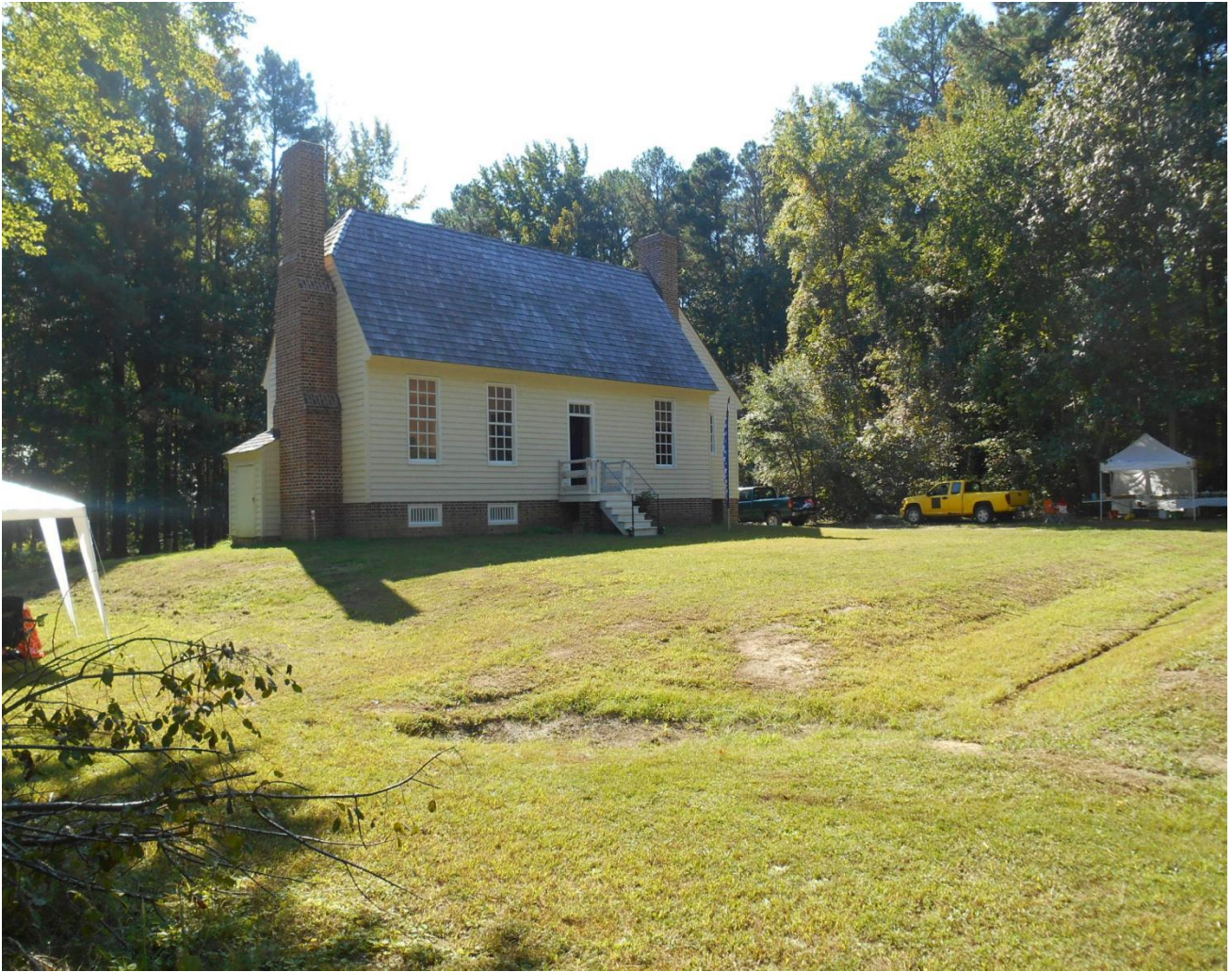
James Monroe Birthplace home on original home site