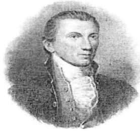
JAMES MONROE MEMORIAL FOUNDATION