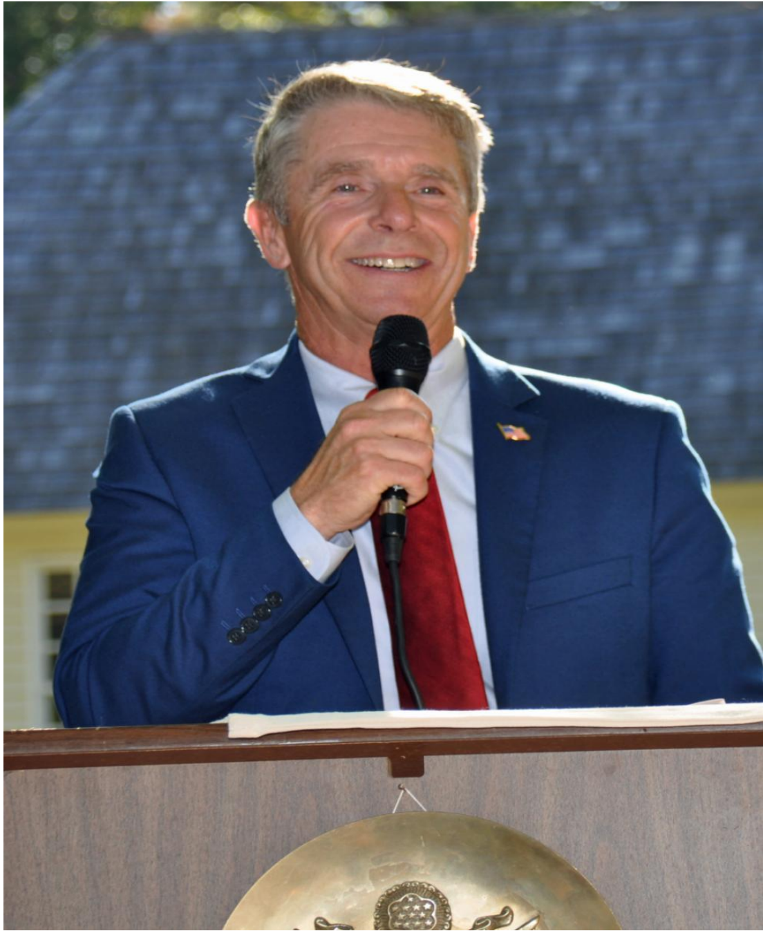
U.S. Congressman Robert Wittman addresses the crowd at Monroe birthplace