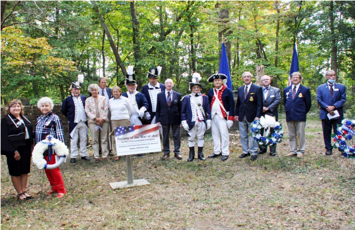
At the grave site at Sabine Hall

In addition, wreaths were laid by Rappahannock and James Monroe chapters of the Daughters of the War of 1812 pictured above (see program).