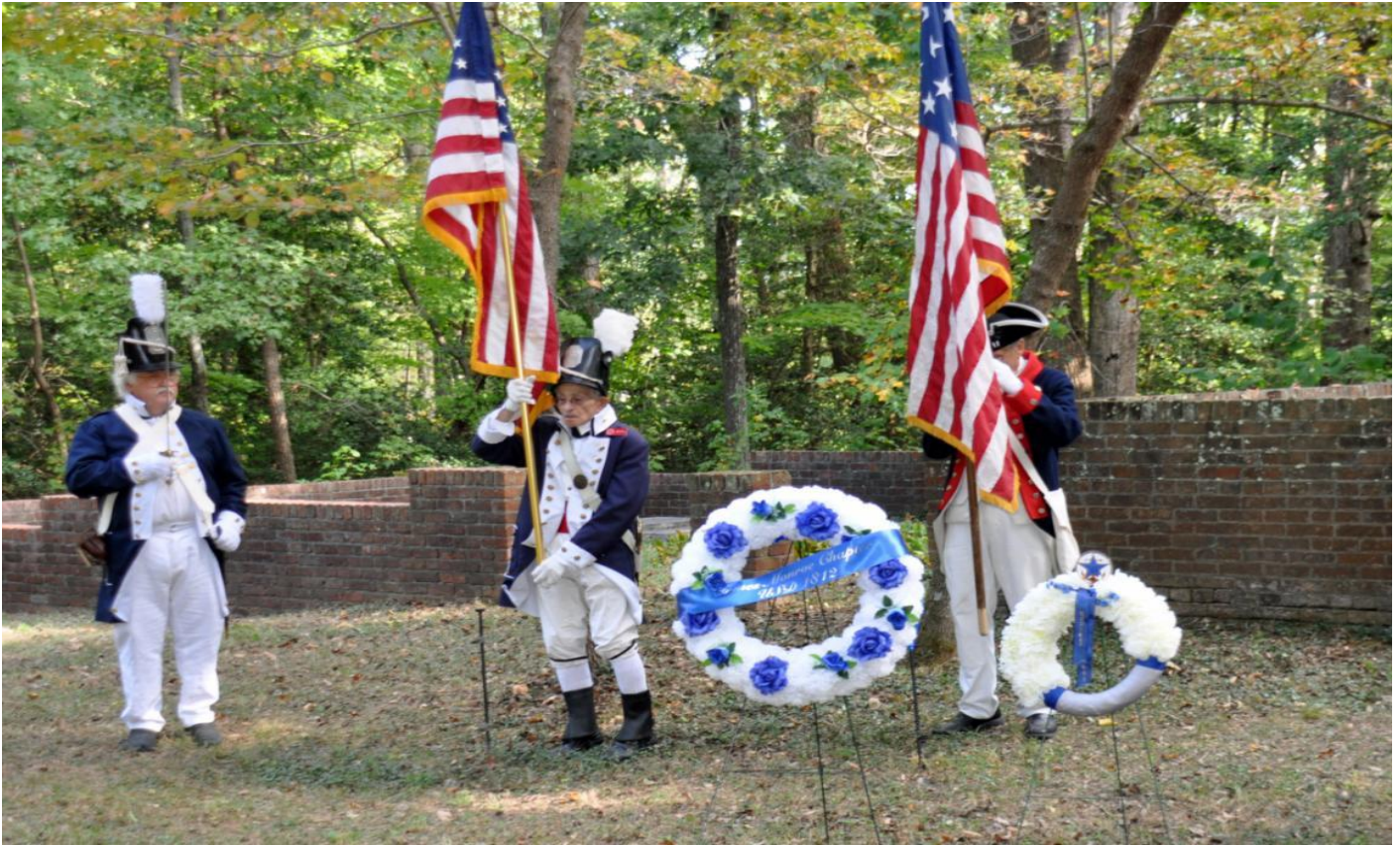
Society color guard opens the ceremony