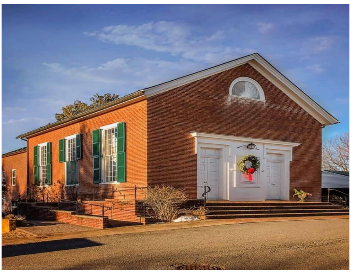
Piedmont Episcopal Church, Madison, Virginia