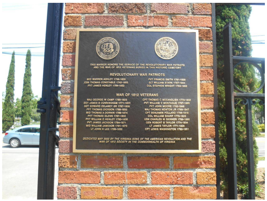
Plaque listing Revolutionary and War of 1812 veterans buried at Cedar Grove