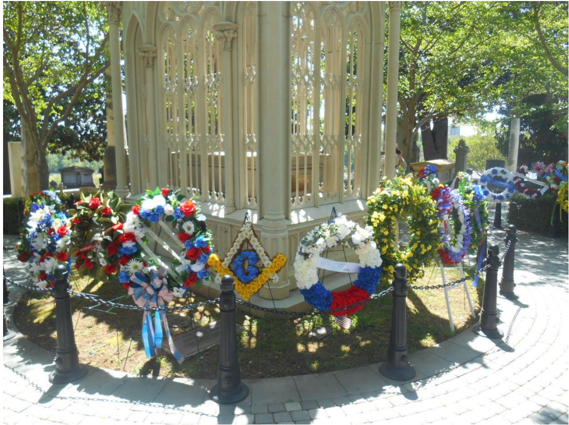
Some of the forty-four wreaths left at the tomb of James Monroe at Hollywood Cemetery, Richmond, Virginia on April 28, 2022