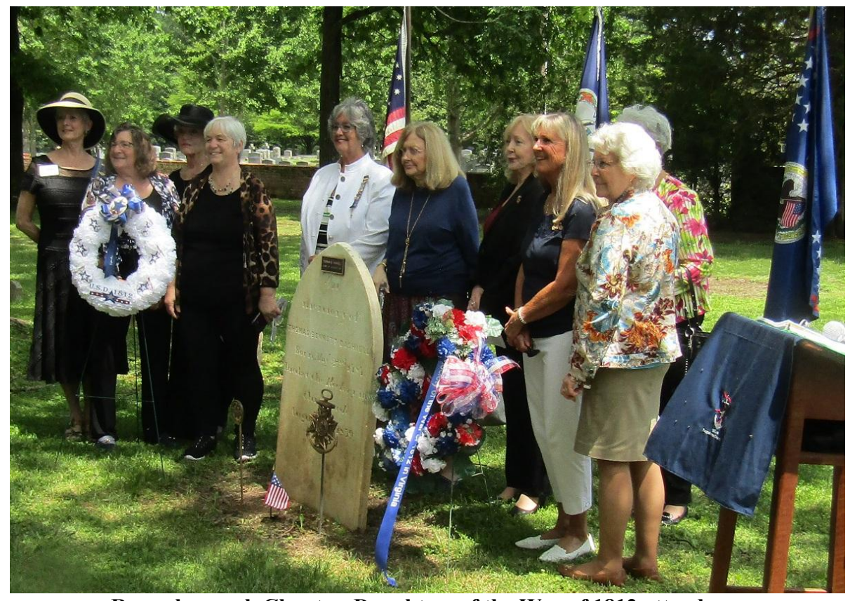
Rappahannock Chapter, Daughters of the War of 1812 attendees