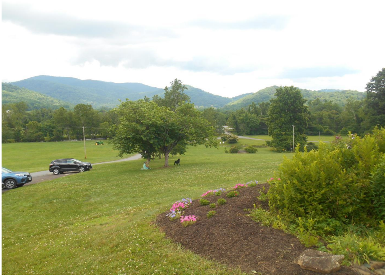
View from the Graves Mountain Lodge