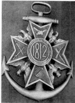
War of 1812 Grave Marker

He died in January 1859 and has a gravestone in the cemetery