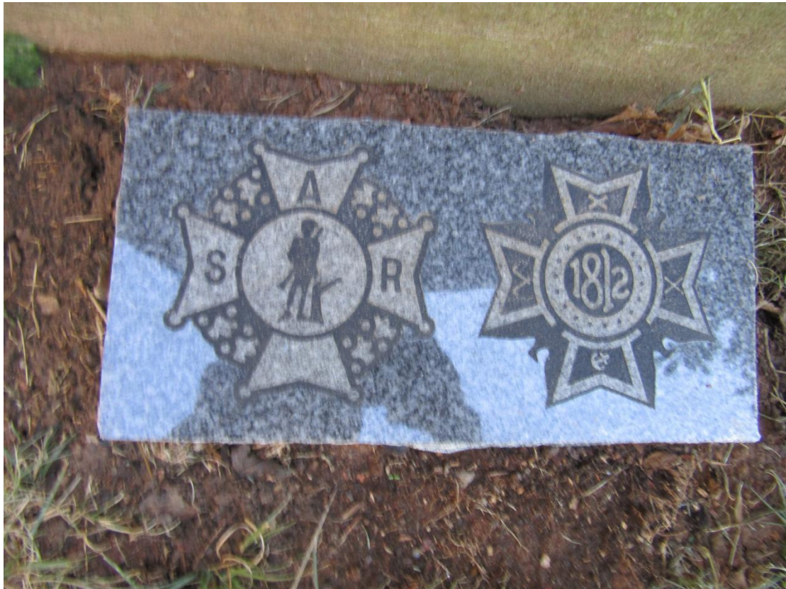
Dual grave markers used at the ceremony