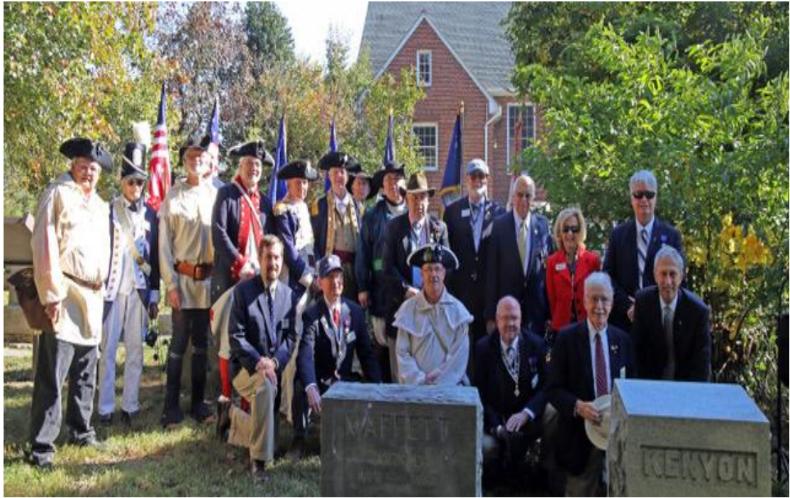
Representatives of several chapters of the Virginia Society, Sons of the American Revolution, and the Society of the War of 1812 participated in joint event at Flint Hill Cemetery, Oakton, Virginia