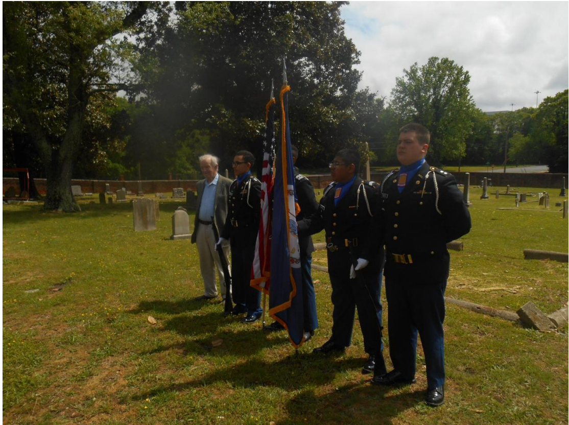
Members of the John Marshall ROTC formed the color guard for the event