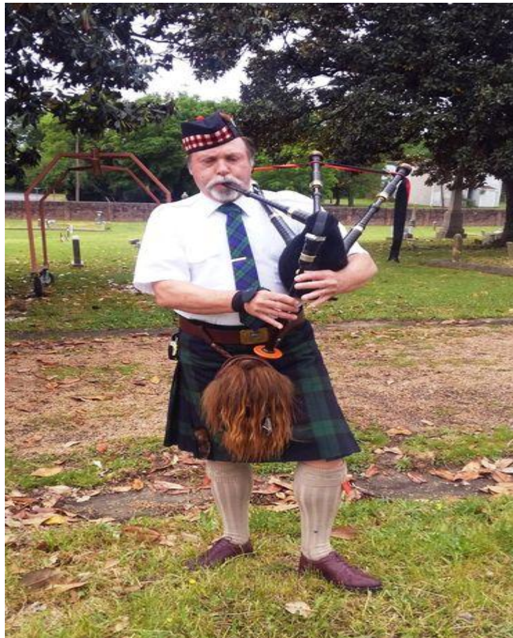
Piper performed "Amazing Grace"