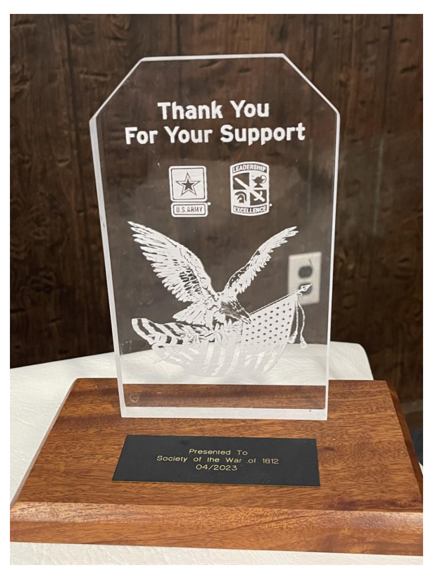
Plaque from Norfolk State University ROTC to the Virginia Society of the War of 1812