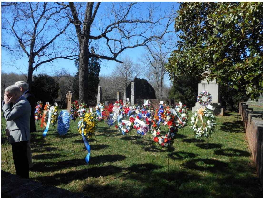
Wreaths presented during the Madison event