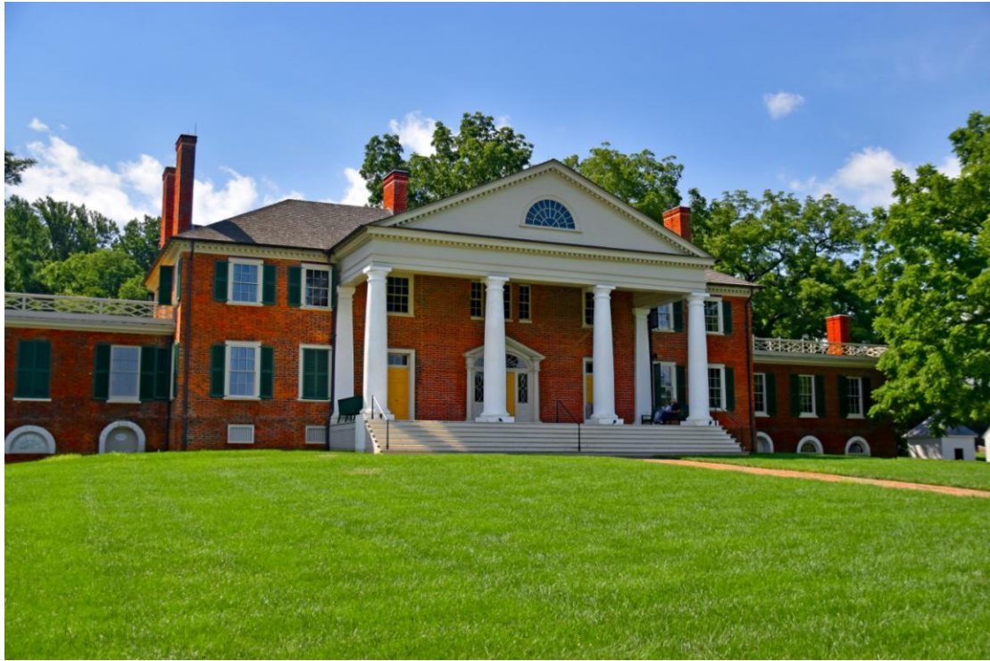
James Madison's Montpelier

The next Society of the War of 1812 in Virginia event is the presenting of the presidential wreath at the tomb of President John Tyler in Hollywood Cemetery, Richmond, Virginia on March 29, 2024. The event is scheduled to be held at 11 a.m. and will include a reading of the proclamation from the President of the United States and the U.S. Army band. Society members are urged to attend if possible.