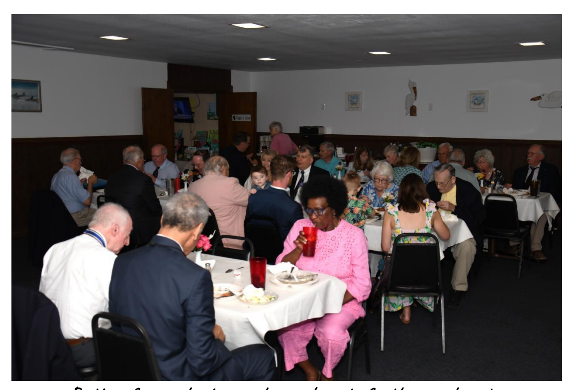
Portion of room showing members and guests for the annual muster