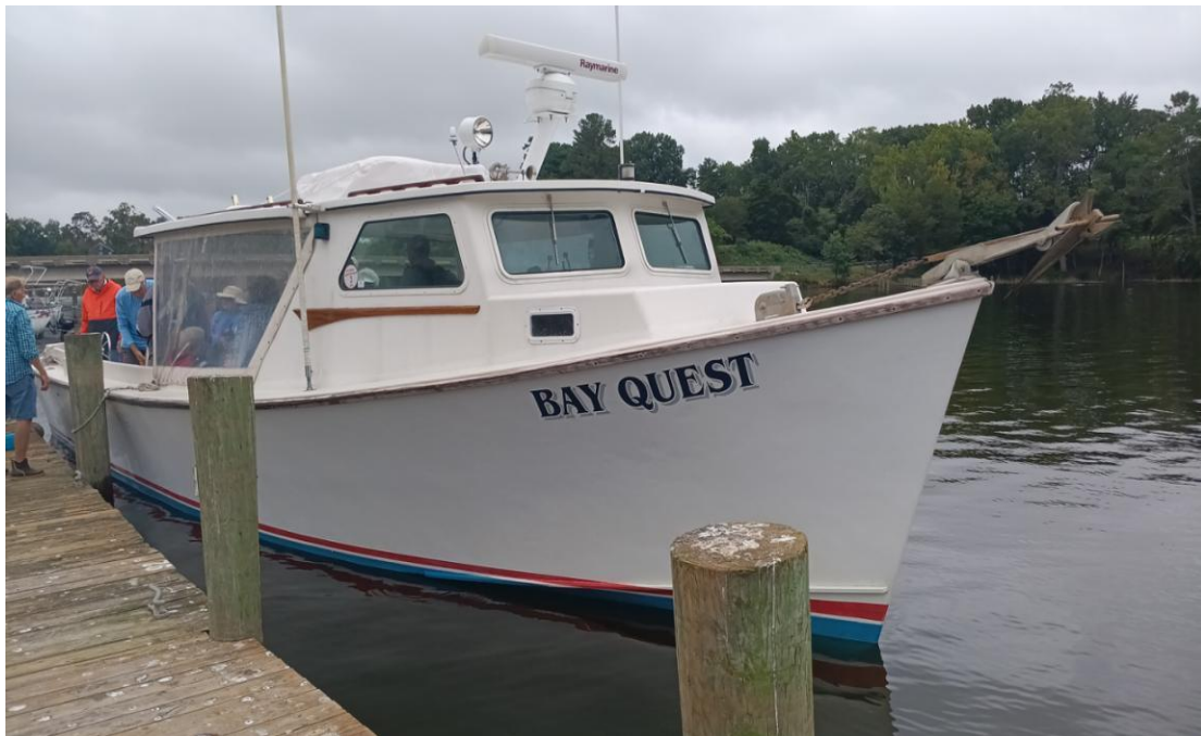
Charter boat used to explore the creeks and rivers of the Northern Neck of Virginia